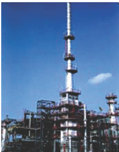
Fig. 5.5: A petroleum refinery

fractions of petroleum is known as refining. It is carried out in a petroleum refinery (Fig. 5.5).