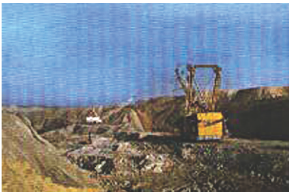
Fig. 5.2: A coal mine

When heated in air, coal burns and produces mainly carbon dioxide gas.