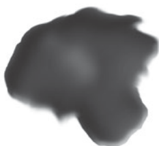
Fig. 5.3: Coal-tar

It is a black, thick liquid (Fig. 5.3) with unpleasant smell. It is a mixture of